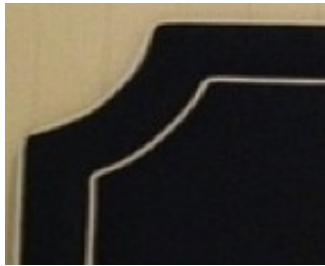
FRONT WELTED BORDER