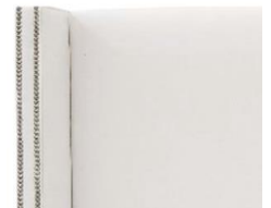
DOUBLE NAILHEAD BORDER ( WITH OR WITHOUT WELT )

With Welt: _____ Contrast Welt: _____ Nail Size: _____ Nail Color: _____