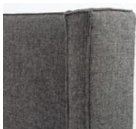
DOUBLE WELTED BORDER

Opt. Nail Size: _____ Opt. Nail Color: _____ Opt. Nail Loc. _____