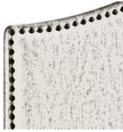
WELTED TOP BORDER WITH NAILS