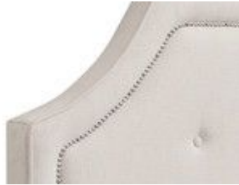
FRONT WELTED NAILHEAD BORDER

Contrast Welt: _____ Nail Size: _____ Nail Color: _____